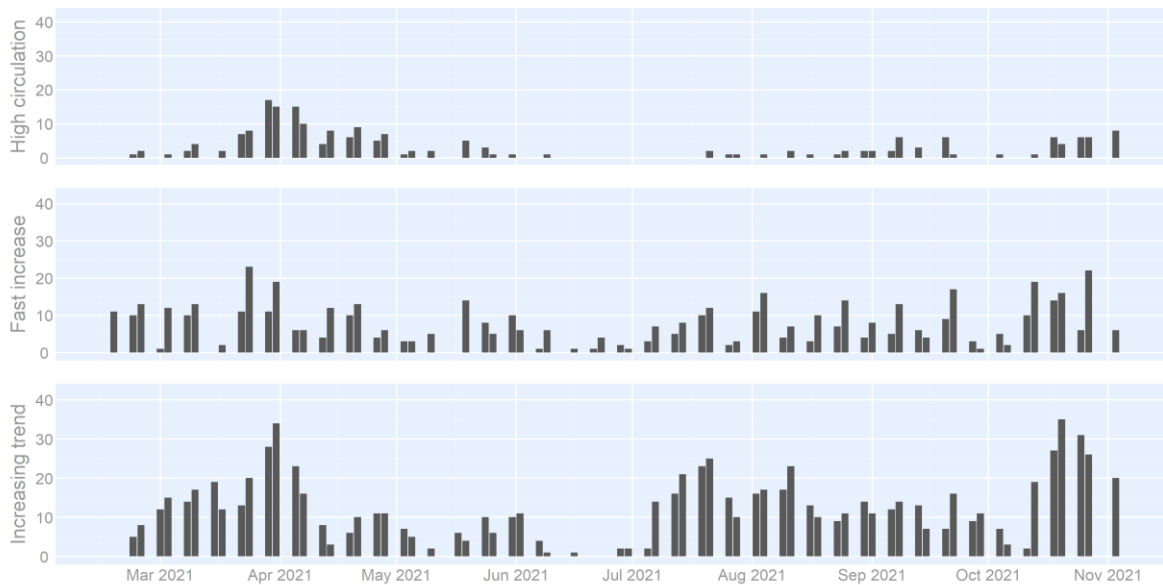
Figure 3: The number of areas (amongst the 41 covered by the wastewater surveillance this week and the 42 normally considered), with positive alerting indicators (latest results on November 03th 2021).

Also, the reduction of the “Fast increase” and “Increasing trend” plant’s number observed in the last results may be caused by: i) a decrease of the viral concentration in some areas, ii) recent rainy events diluting the viral concentration measured, iii) and/or the fact that no samples were analysed on the 1 st November 2021. Therefore, the “Fast increase” and “Increasing trend” indicator’s situation will be assessed next week with a higher level of certainty.