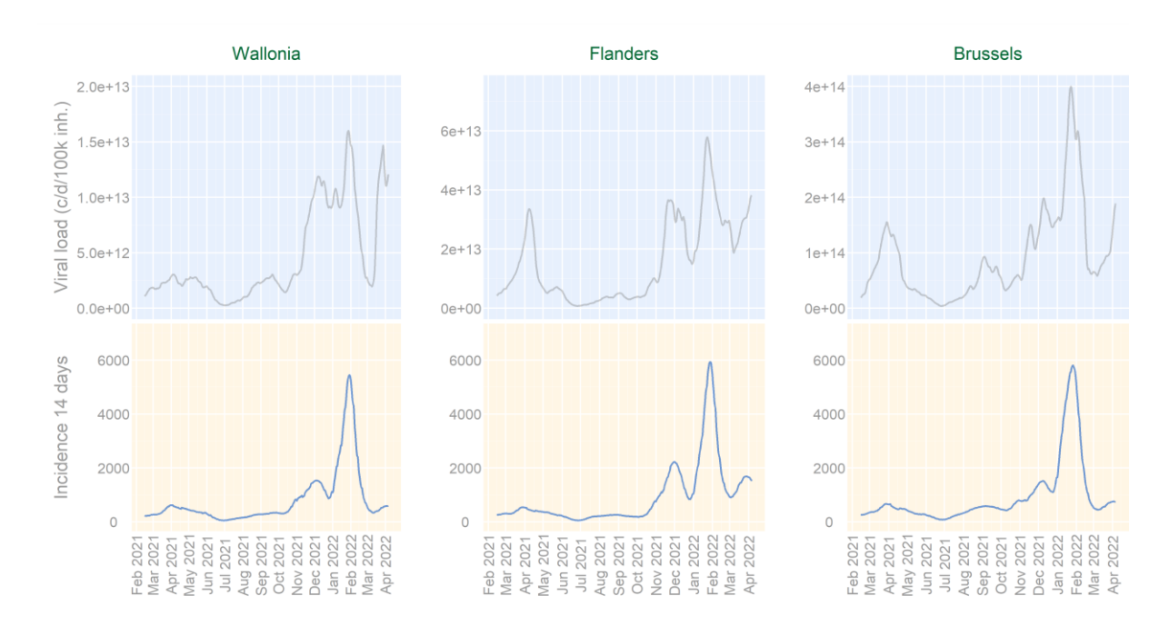
Figure 2: The SARS-CoV-2 RNA viral loads expressed as copies/days/100k habitants (based on the past two weeks moving average applied on the linear interpolation) (Top), and the 14 days incidence in the population covered by the wastewater surveillance since mid-February 2021 (bottom).